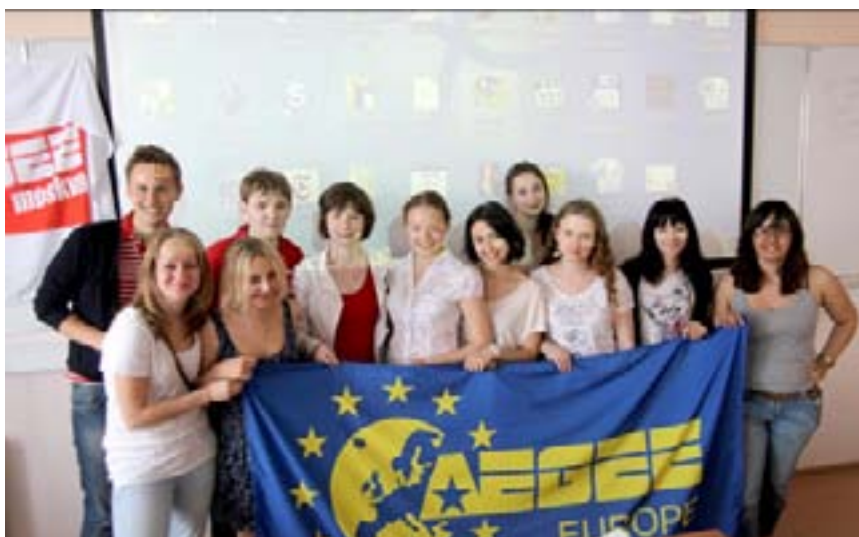
THE PARTICIPANTS OF THE RTC ORGANISED BY AEGEE-MOSKVA