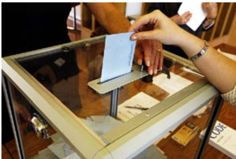
FIRST BOARD OF SPORTS WORKING GROUP WAS ELECTED