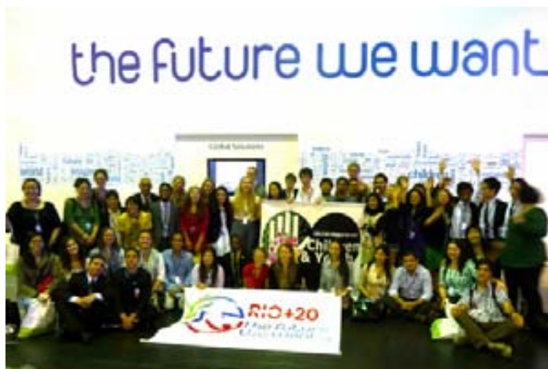
YOUTH AT THE RIO+20 SUMMIT IN RIO DE JANEIRO, BRAZIL (13-22 JUNE)